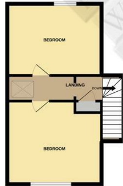
2ND FLOOR 293 sq.ft. (27.3 sq.m.) approx.