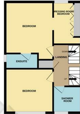
1ST FLOOR 482 sq.ft. (44.8 sq.m.) approx.